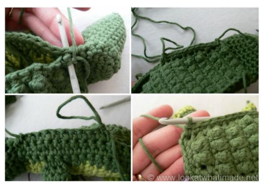
If you need help, you can find the photo tutorial HERE.

You are going to start at the end closest to the head this time so, with a sl knot already on your hook, insert your hook into the first row of the back and into the first stitch of the last row of the side. Make a sl st through both layers. Insert your hook into the next row of the back and into the next stitch of the side and make a sc through both layers. Continue making 18 more sc's through both layers, working into each row of the back and each st of the side. Do not bind off. You will now make the tail.